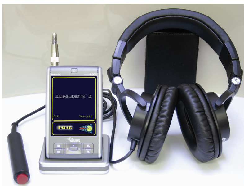
Fig. 3. Unit for screening examination.

The screening examinations were performed using the 'Audiometr S' unit developed through the cooperation of the Institute of Physiology and Pathology of Hearing and the Institute of Innovations in Mining Industry EMAG in Katowice. The unit consists of the PDA microcomputer, headset and the patient's button. The unit can be programmed with different types of hearing test depending on what is necessary. During the screening program the following tests were used: air conduction hearing threshold audiometry for frequencies 250-8000 Hz and the test of central processing of auditory information (DDT - dichotic digital test). In the audiometry the criterion of the norm was a hearing threshold not exceeding 20 dB HL for frequencies of 250-8000 Hz. The unit was additionally equipped with an audiological questionnaire and background noise monitoring function. Screening examinations were conducted during lessons, in quiet rooms provided by the school's headmaster. Results of all tests were collected in the unit's database and uploaded to the central database of the program through the internet.