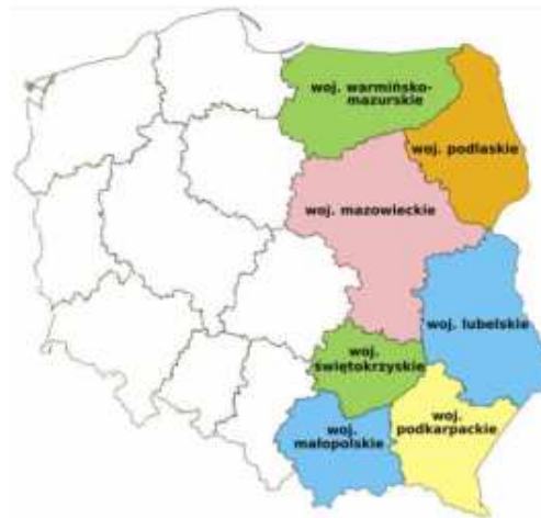
Fig. 1. Regions where the screening program was implemented

Table 1 presents the main parameters of the program.